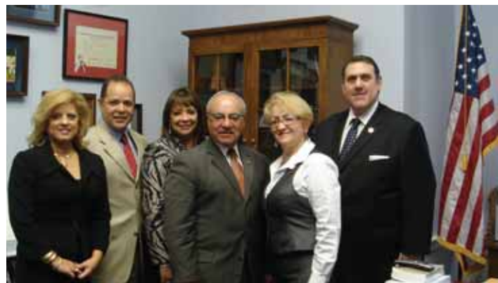
NHCSL leadership meets with Congressman Joe Baca (CA)

In meetings with Congressman Luis Gutierrez (IL) and Congressman Ben Ray Lujan (NM), members stated that it is important to include other faces – such as the Irish, Asian, and African populations - in the talks about immigration reform. This would convey the fact that many groups are impacted by immigration laws, while the effect on Latinos has become all-too-familiar. The members also participated in a press conference alongside U.S. Senator Bob Menendez (NJ) to inform the public of concerns Hispanics currently face with issues such as the enforcement of 287(g) in Arizona and Georgia. 🌐