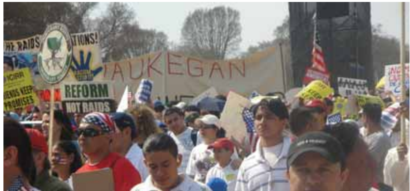
Over 200,000 marched for comprehensive immigration reform in the nation's capital on March 21st.