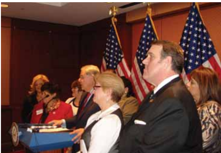
NHCSL members participate in press Conference at the U.S. Senate Democratic Hispanic Task Force