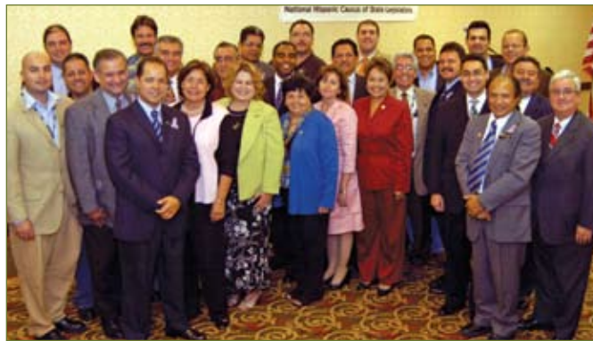
Hispanic State Legislators at NHCSL Summit